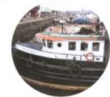
Commercial/ Work Boats